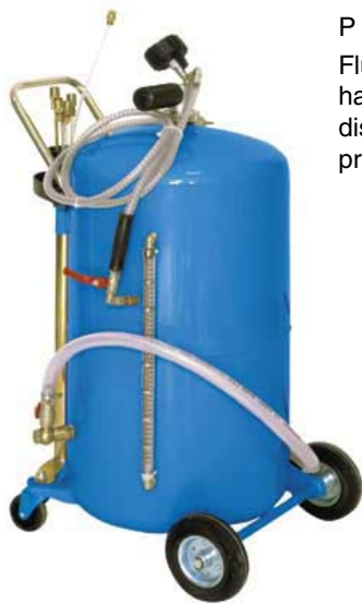
P / N 24270 Fluid Extractor with 21-gallon capacity, has level gauge with metal guard and 6' discharge hose. Unit is self-evacuating by pressurizing tank with approximately 10 PSI.