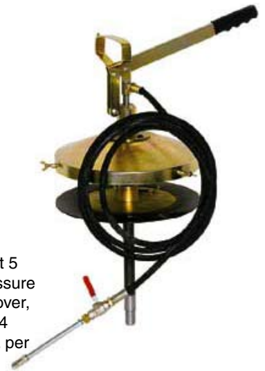
P / N 10050 Heavy duty hand operated grease pump to fit 5 to 6½ gallon pails. Pump is intended for pressure applications and is supplied complete with cover, follower plate, 10 ft. hose, shut-off valve and 4 jaw coupler . Generates 4,200 PSI and 1 oz. per stroke.