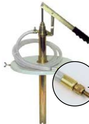
MODEL MA-10M , P / N 10010M Lever pail pump fits 5 to 6½ gallon pails. Dispenses gear lube via a 6' nylon reinforced vinyl hose with curved discharge spout. Positive lock nut holds pump securely in position. Approx. 16 strokes/pint.

Lower gear case fitting for use with outboard marine engines.