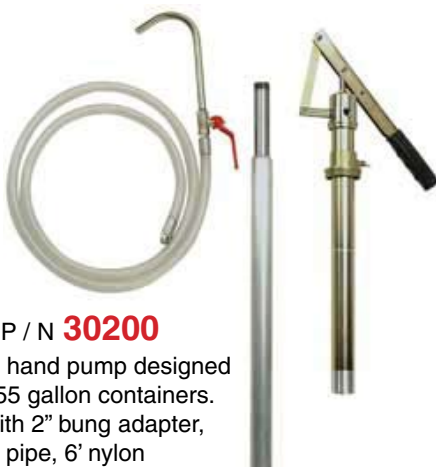
MODEL MA-70 P / N 30200 Heavy duty gear oil hand pump designed to fit 5, 16, 30 and 55 gallon containers. Comes complete with 2" bung adapter, telescoping suction pipe, 6' nylon reinforced discharge hose, ball shutoff valve and curved discharge spout. Approx. 4 strokes/qt.