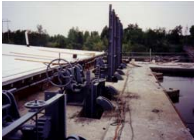
Flow control gates lubricated with LE 4024 QUINPLEX Food Machinery Lubricant